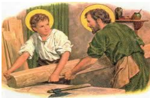
Men of Faith - Brothers in Christ

Theme: Being a Man of the Catholic Church Men from other parishes are invited to join us